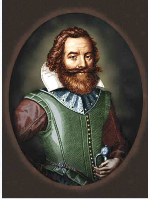
Captain John Smith